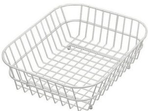
White basket 8612 100