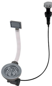
Gun Metal automatic waste fitting - PG